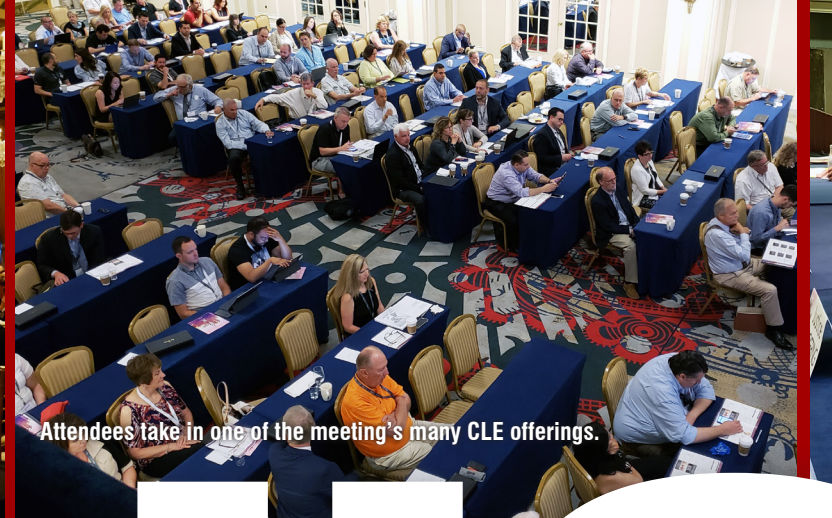
Attendees take in one of the meeting's many CLE offerings.