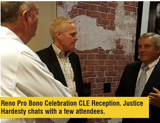
Reno Pro Bono Celebration CLE Reception. Justice Hardesty chats with a few attendees.