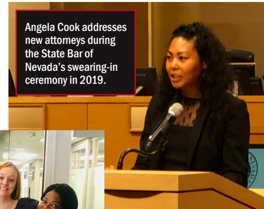
Angela Cook addresses new attorneys during the State Bar of Nevada's swearing-in ceremony in 2019.