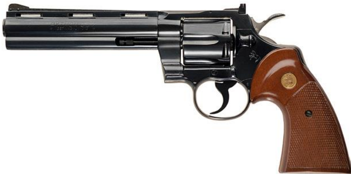
Colt Python, 6 inch barrel