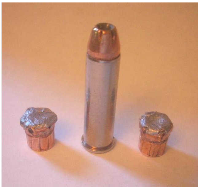
.357 Magnum shells (Left): from victim (Center): new, not fired (Right): test fire shell from Python in evidence locker