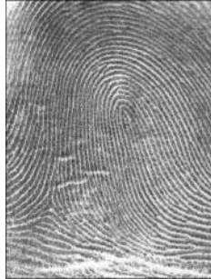
Alley wall (match)