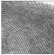
Water bottle (insufficient to make a determination)

Fingerprints have been enlarged for visibility