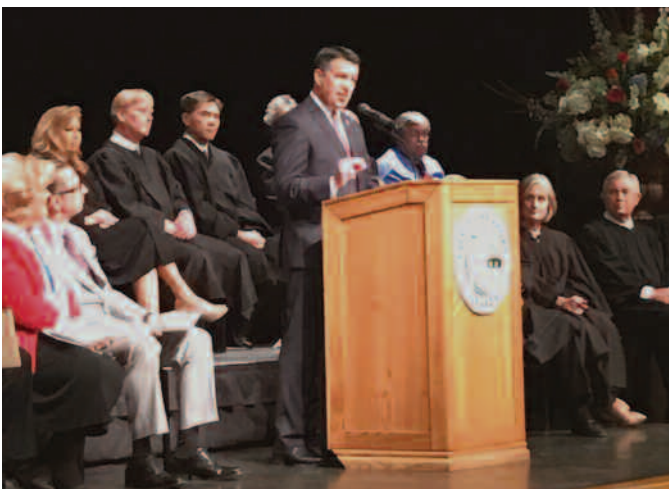
Governor Brian Sandoval address at Opening Ceremony of Nevada Supreme Court's Las Vegas Building

The GLS furthered its long history of philanthropic work this past year by funding over $32,000 in sponsorships. On March 27th, the Section was honored to be the Platinum level sponsor for the Grand Opening Ceremony of the Nevada Supreme Court’s new Las Vegas building.